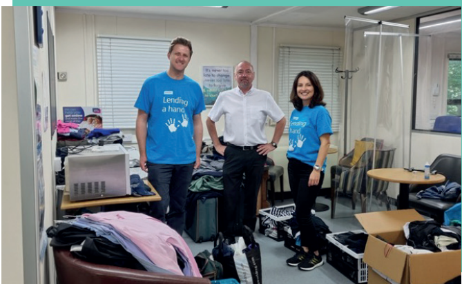
*Skanska's Mindenhurst team volunteered in the community for 'Lend-a-Hand' Week