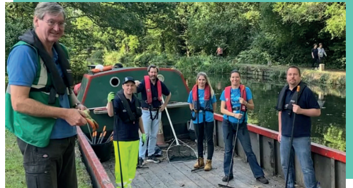
*Skanska's Mindenhurst volunteers helped clean the Basingstoke Canal